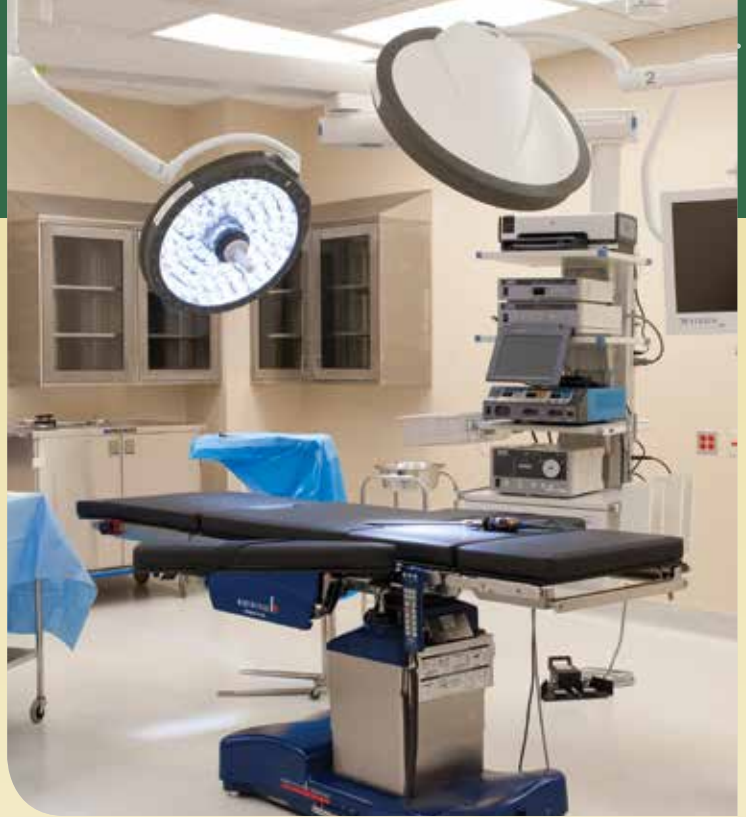
State-of-the-art Wood County Hospital Surgery Center